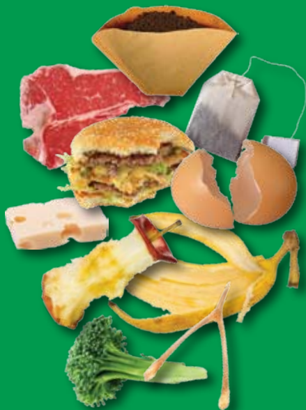
Food Scraps, Meat, Poultry, Fish, Bones, Fruit, Vegetables, Dairy