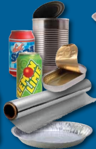
Metal Cans, Aluminum Foil, Small Scrap Metal