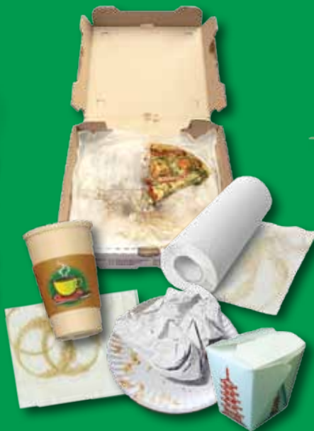
Food & Beverage Soiled Paper