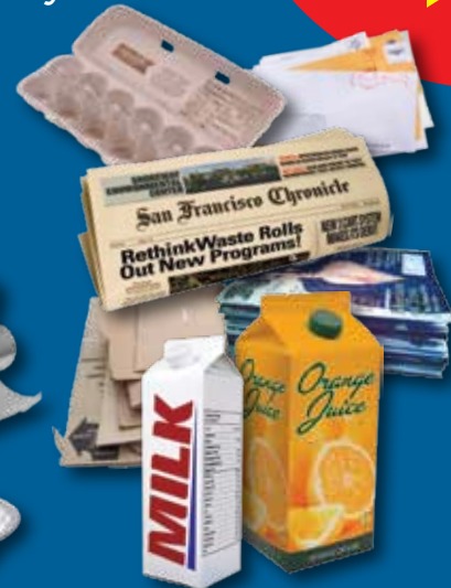
Paper, Cardboard, Milk & Juice Cartons, Paper Egg Cartons, Newspaper, Magazines, Junk Mail