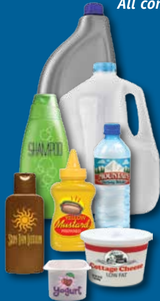
Plastic Containers Numbered ♻️ 1-7

All containers must be empty. Rinsing not necessary.